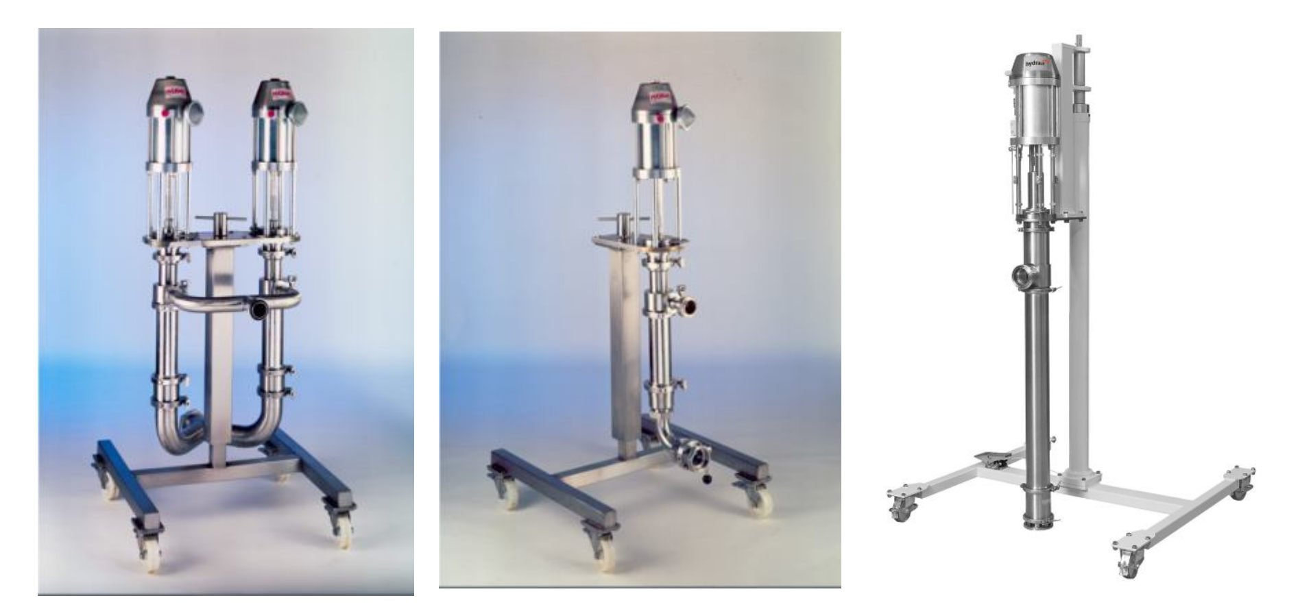
Mobile system with two jointed 6" pumps. Delivery 60 l/min